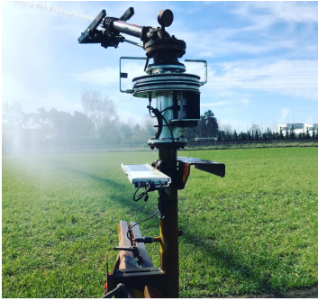
Mounting a Sector Control on a Irrigation Trolley.